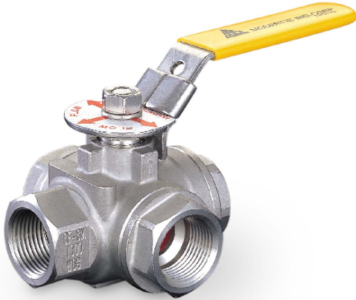
Fig No. K-301T Standard Bore 1/4" ~ 2" DN 8- DN 50