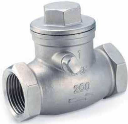
Fig No. SC-200 Full Bore 1/4" ~ 3" DN8 ~ DN80